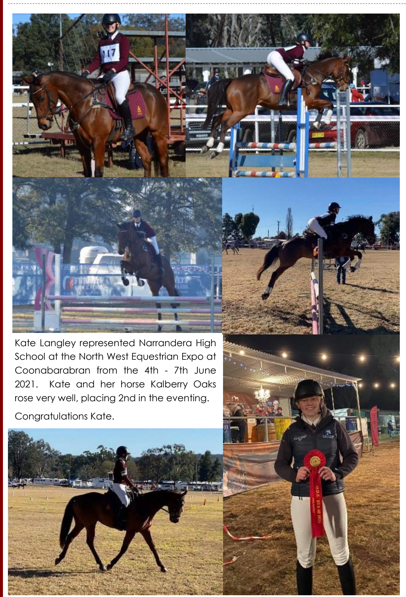
Narrandera High School Newsletter