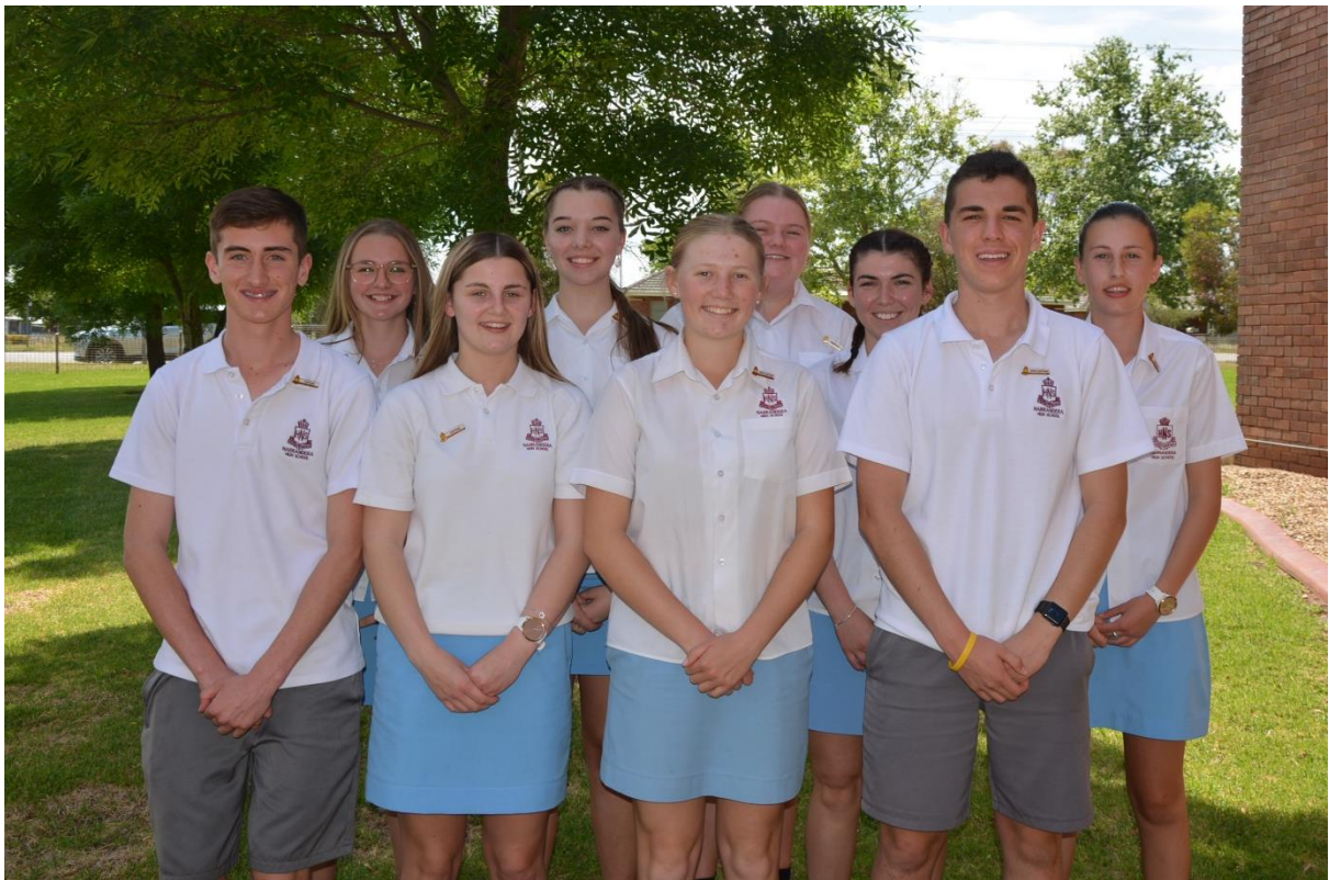
Student Leaders 2021

Each year group elects members to represent them on the SRC. The SRC meets to discuss students' views on various matters that concern the school and its students.